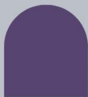
COLOR 3 #584470