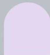
COLOR 4 #E3D8F0