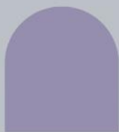
COLOR 2 #968EAF