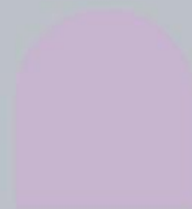
COLOR 4 #C7B4CF