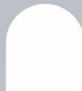
COLOR 4 #FFFDFD