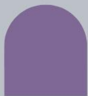
COLOR 1 #806896

THESE COLORS REFLECT OUR BRAND'S IDENTITY AND PERSONALITY