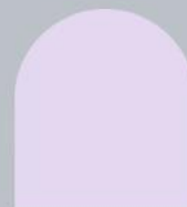
COLOR 4 #E3D8F0