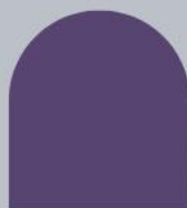
COLOR 3 #584470