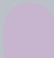
COLOR 4 #C7B4CF